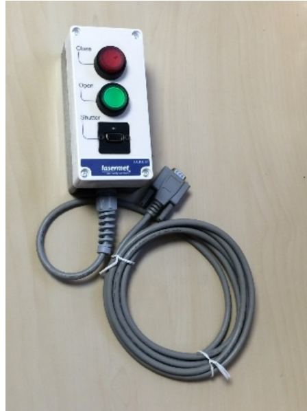
LS-RS-20-FL Remote Switching Station with flying lead

The Remote Switching Station is used to remotely operate the LS-20 Laser Shutter.