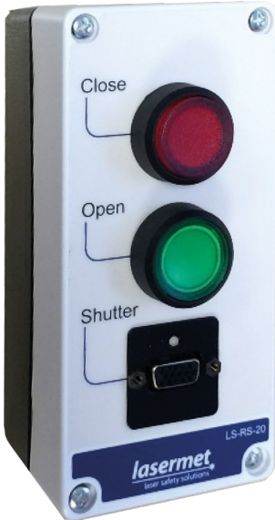
LS-RS-20 Remote Switching Station