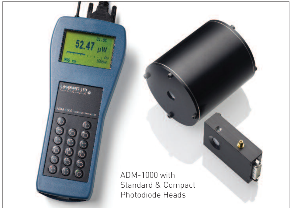
ADM-1000 with Standard & Compact Photodiode Heads

The result is a convenient hand-held power meter with a response rate that is effectively instantaneous and